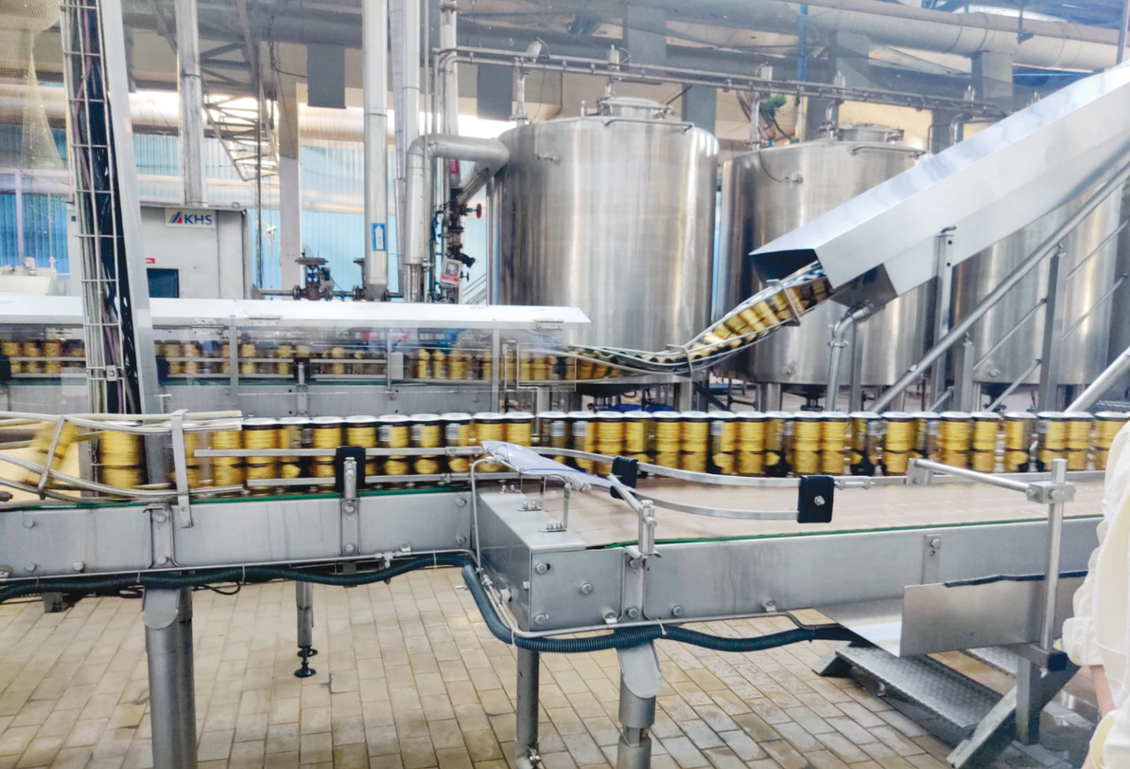
Bottling of Can Beer at Sonipat in M/s Haryana Breweries Pvt. Ltd.